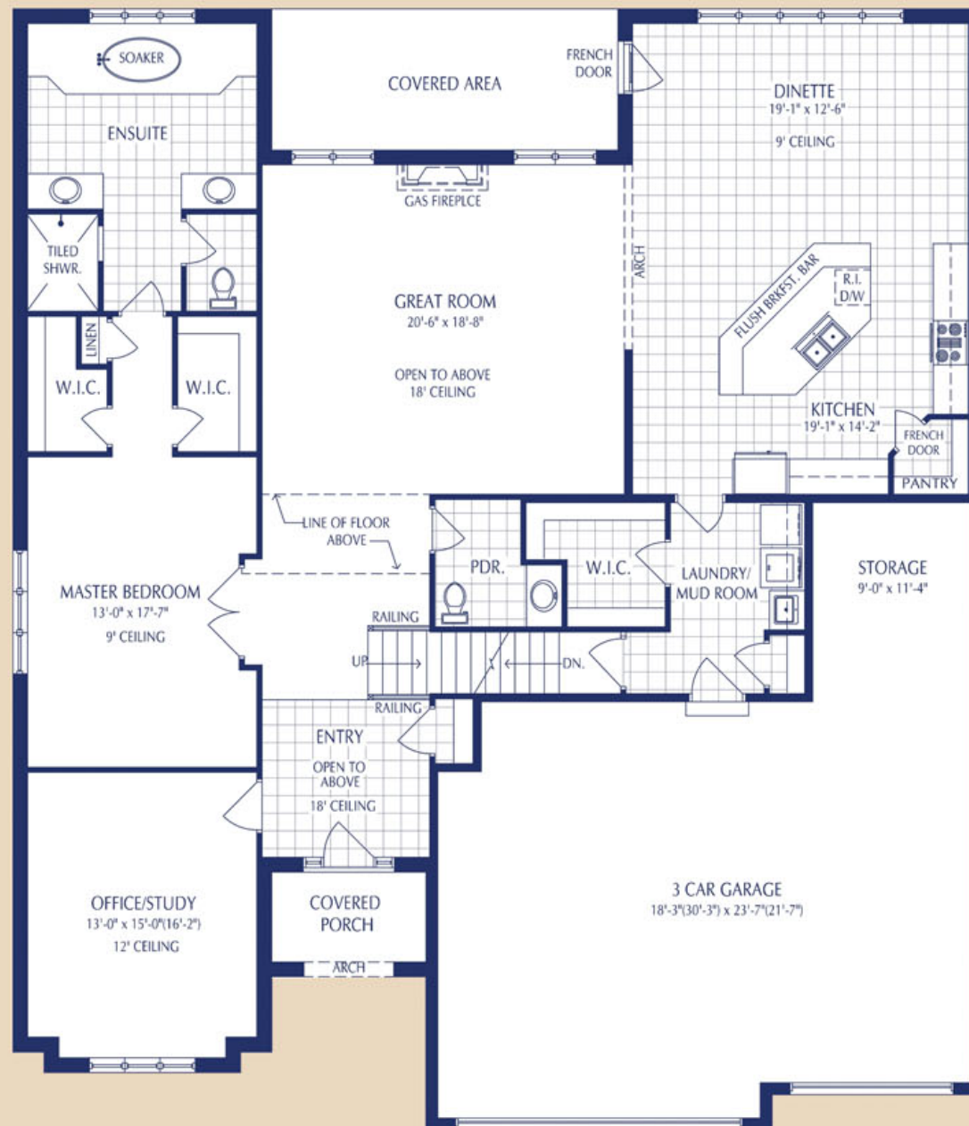
MAIN FLOOR 2290 SQ. FT.